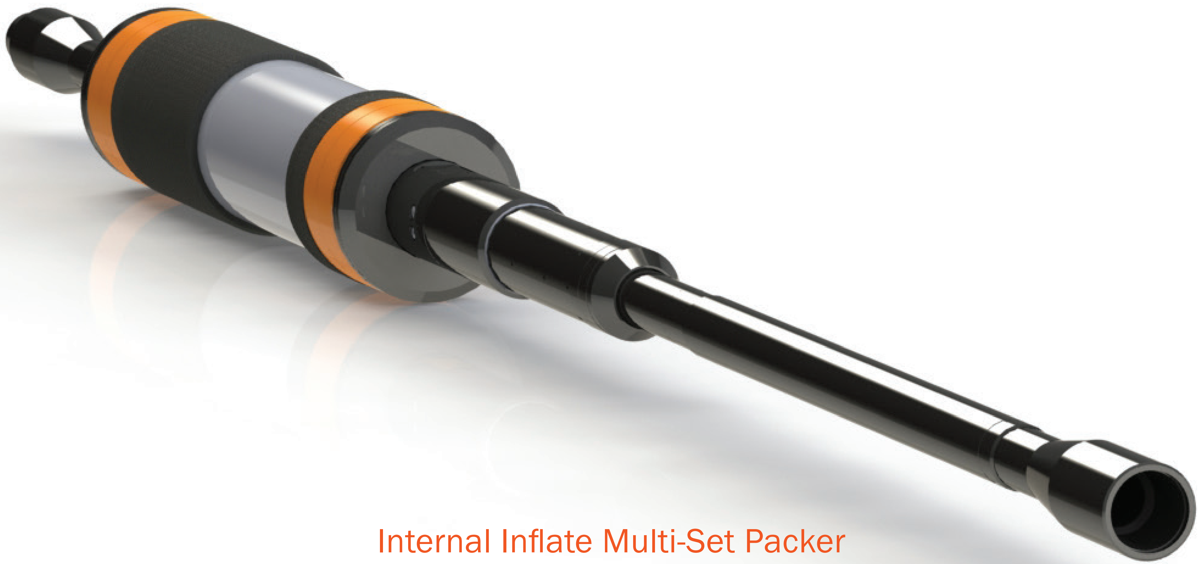
Internal Inflate Multi-Set Packer