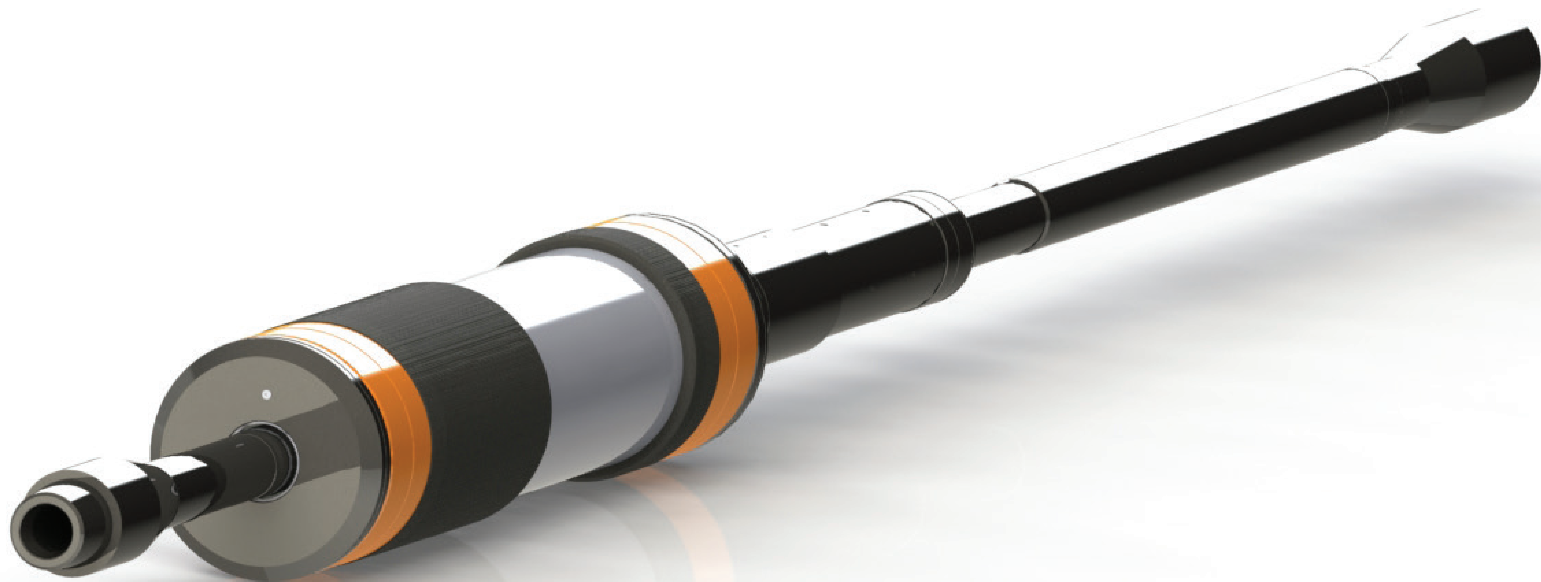
Single-Set Inflatable Packer